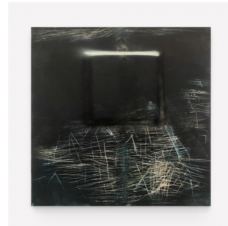
Outside the Box mixed media on canvas, 200 x 200 cm