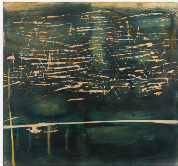
From Day to Day mixed media on canvas, 150 x 160 cm