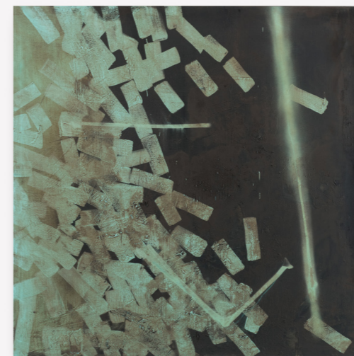
Why Did We Start mixed media on canvas, 120 x 120 cm