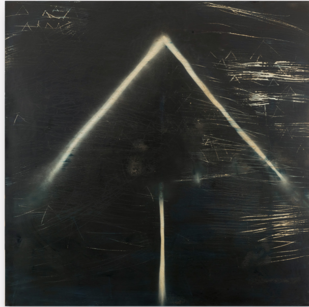
As an Arrow mixed media on canvas, 200 X 200 cm