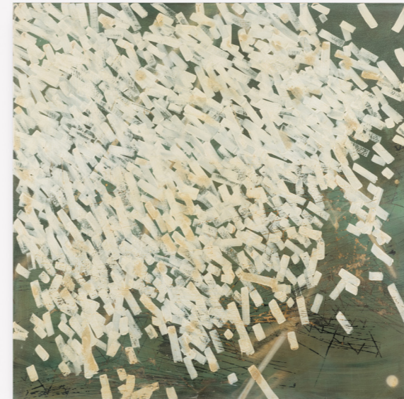
Causal Loop mixed media on canvas, 160 x 160 cm