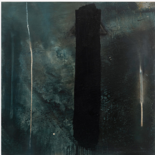
Now and Then