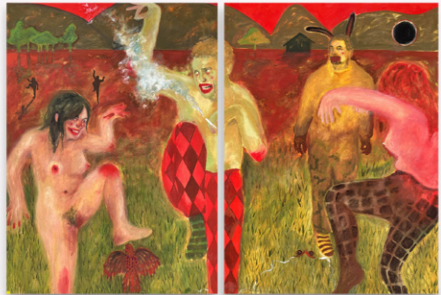
Havin' A Party / The Wild Rumpus

raw pigment, acrylic & oil on canvas, 127 x 92 cm