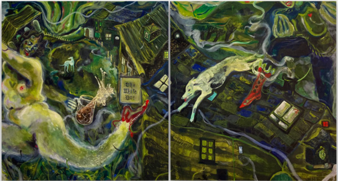
I Have Sold My Soul For This Pint (And I Have No Regrets) , raw pigment, acrylic & oil on canvas, 167 x 304 cm