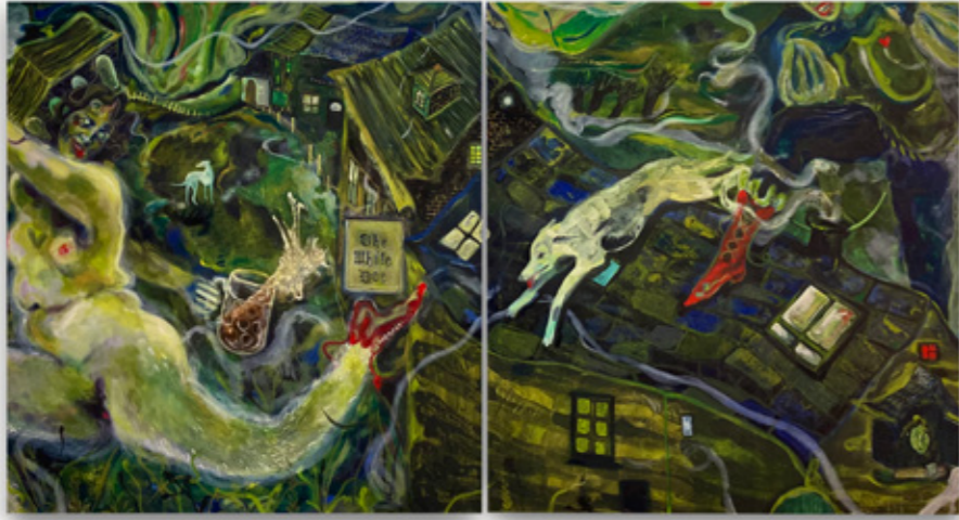
I Have Sold My Soul For This Pint (And I Have No Regrets)

raw pigment, acrylic & oil on canvas, 167 x 304 cm