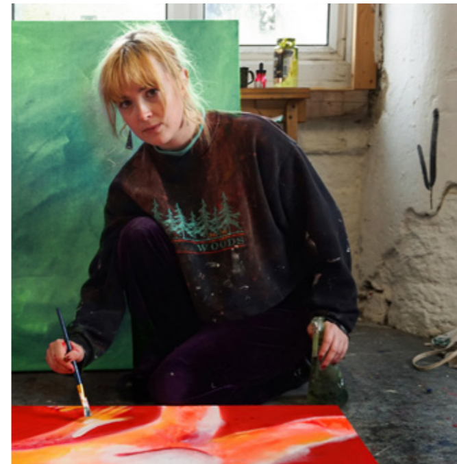
Faye Eleanor Woods

raw pigment, acrylic & oil on canvas, 150 x 225 cm