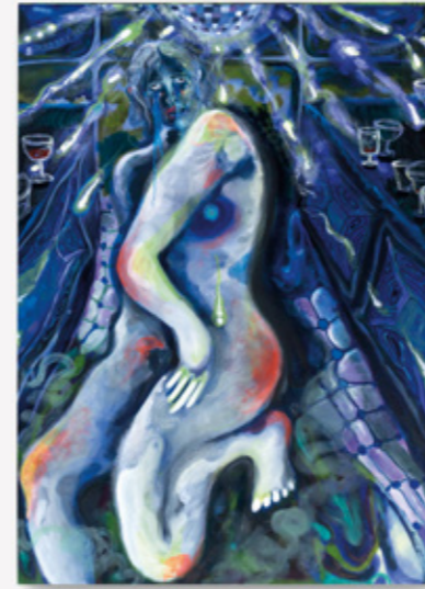
Disco Dancin' / Havin' a Party

raw pigment, acrylic & oil on canvas, 167 x 304 cm