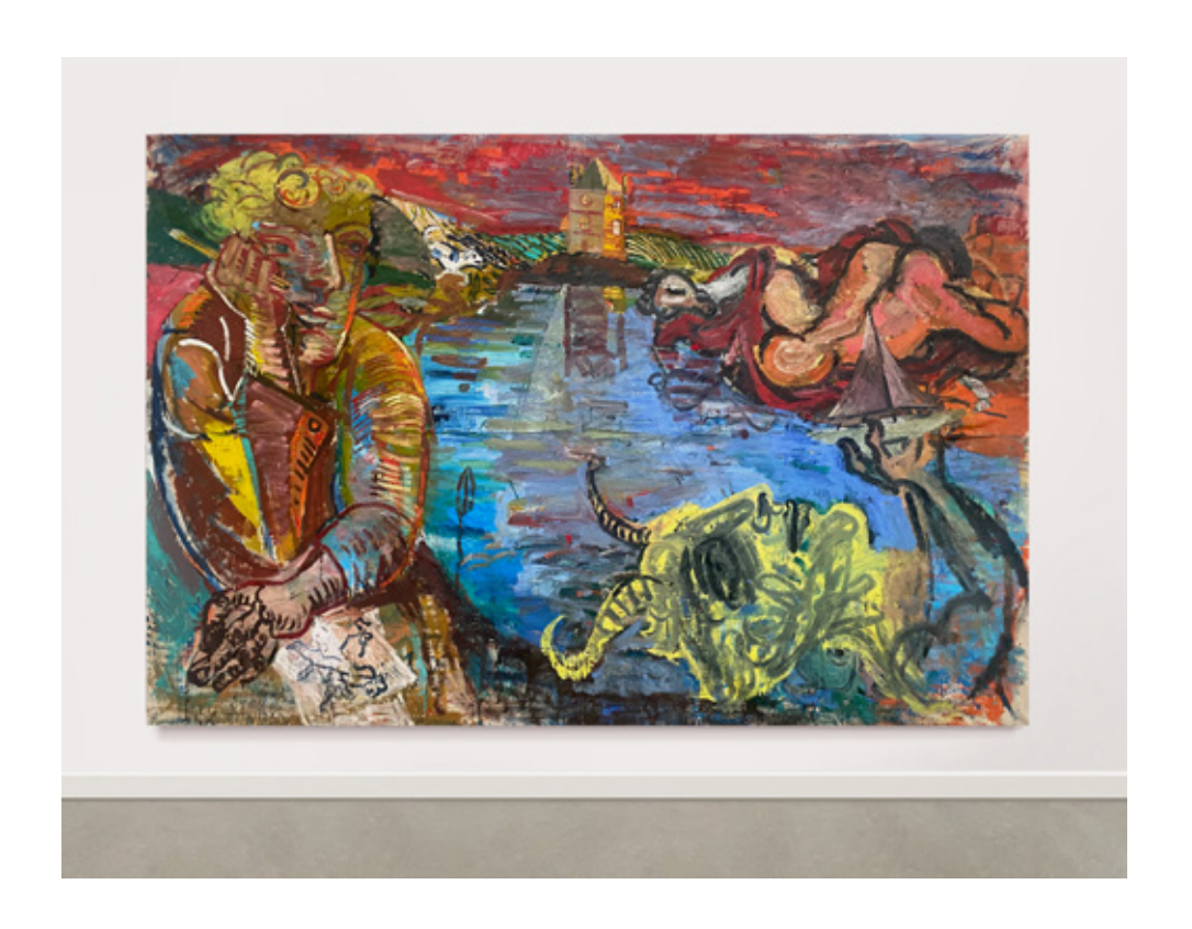
For Those Who Play With the Devil's Toys oil on canvas, 230 x 345 cm