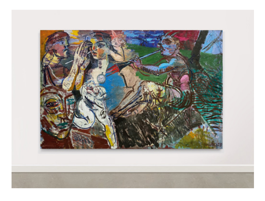
The Hypnotism oil on canvas, 160 x 250 cm