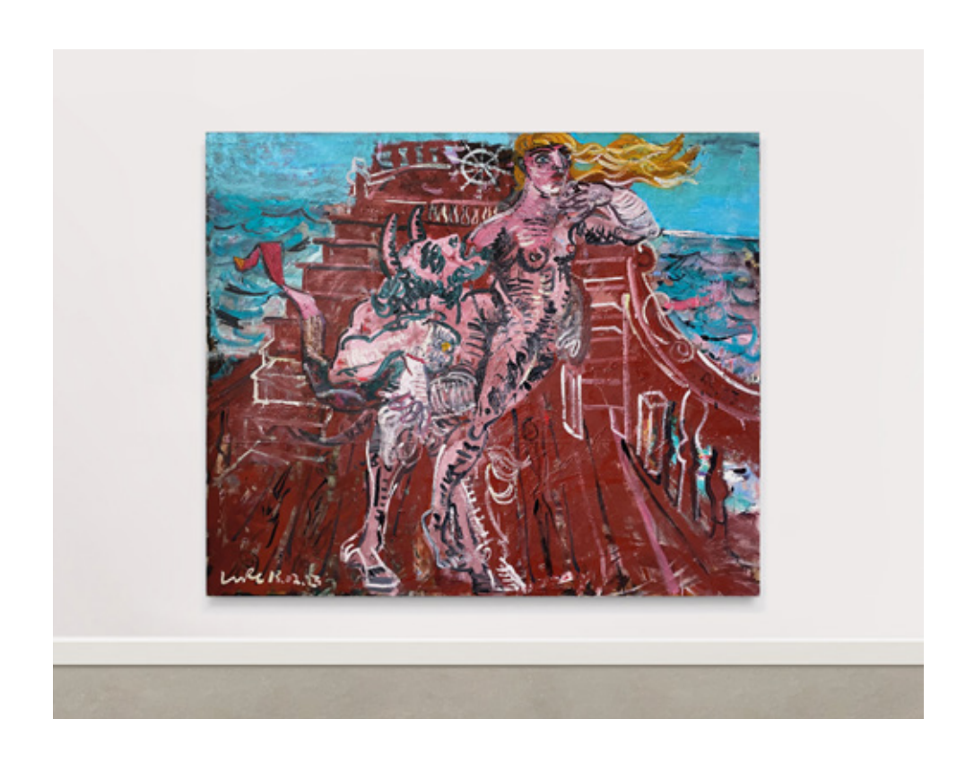
Artemisia's Voyage oil on canvas, 180 x 210 cm