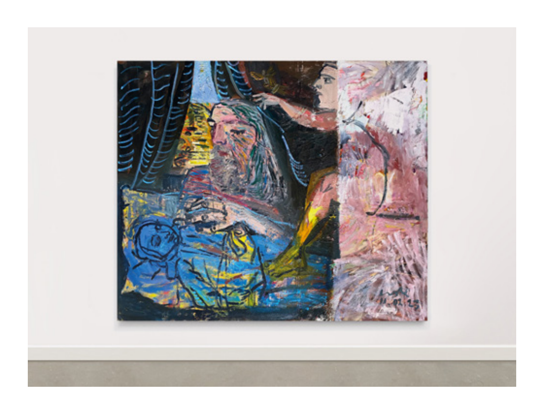
The Death Of The Child oil on canvas, 180 x 210 cm