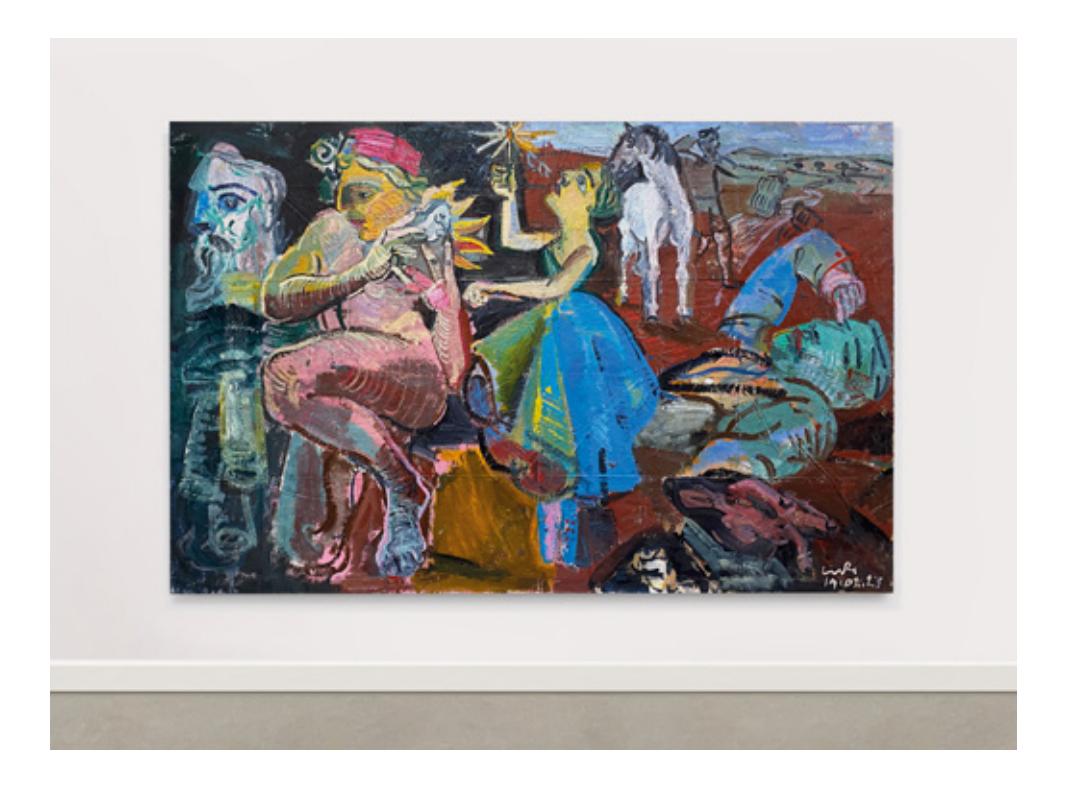
If Truth Be Told oil on canvas, 160 x 250 cm